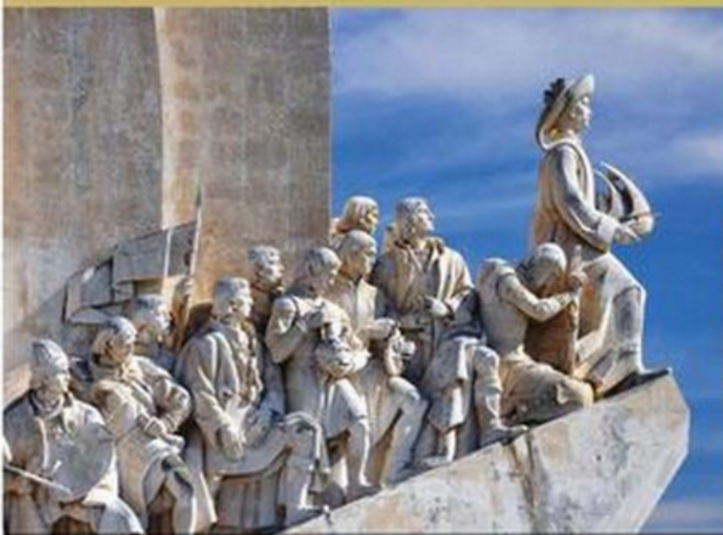
Monument to the Discoveries overlooks the harbor in Lisbon, Portugal