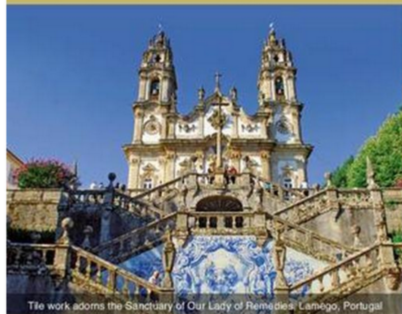
Tile work adorns the Sanctuary of Our Lady of Remedies, Lamego, Portugal