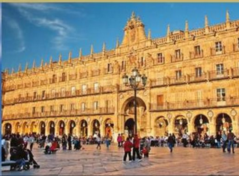
Feel the rhythm of the city in the Plaza Mayor, Salamanca, Spain