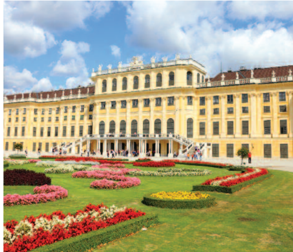
The beautiful gardens of Schönbrunn Palace