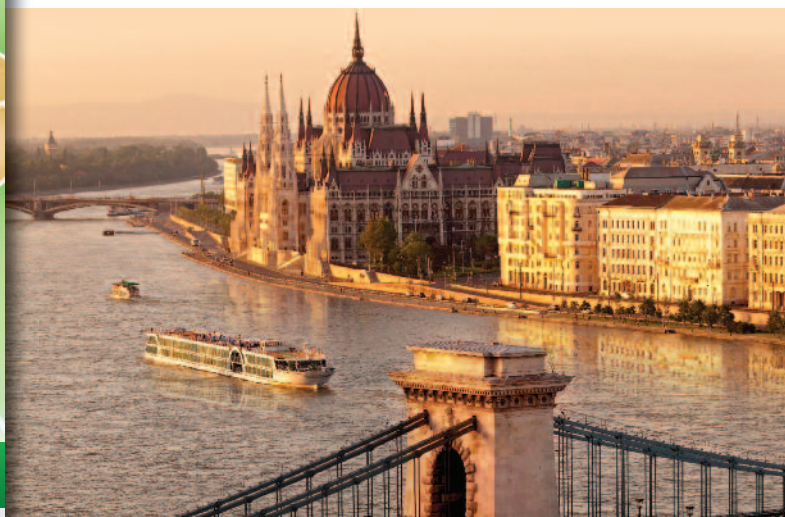
Budapest's Parliament Building sits majestically along the banks of the Danube