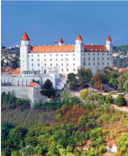
See the Bratislava Castle in Slovakia