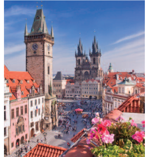
The orange-tile roofs of Prague, Czech Republic